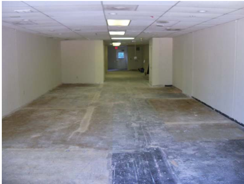
1125 SPRING STREET – 2,000 SQUARE FEET